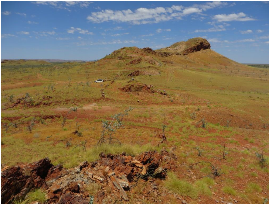
Figure 2: DOM's Hill Prospect, looking south.